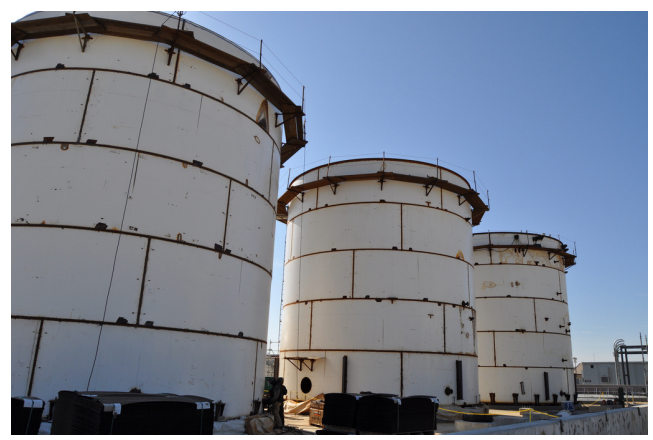
Three of five Hydrolysate storage tanks are complete as of April