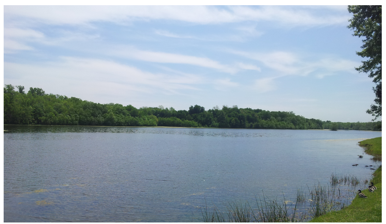
Lake Reba, Richmond KY