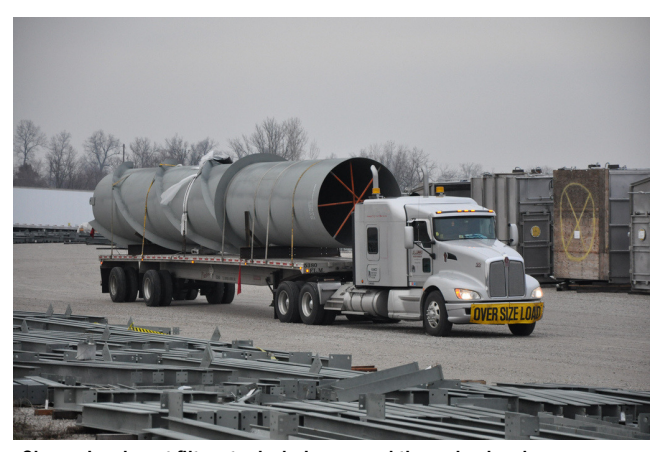
Clean air exhaust filter stacks being moved through a lay down area