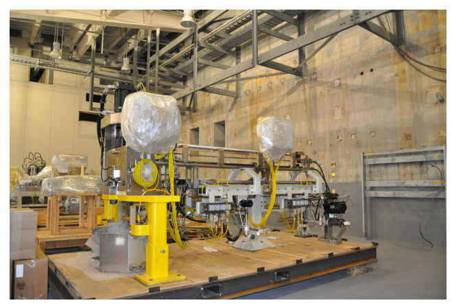
The rocket shear machine (RSM) which will punch and drain the warhead then shear it into multiple pieces for processing in the energetics batch hydrolyzer (EBH), is staged in the MDB