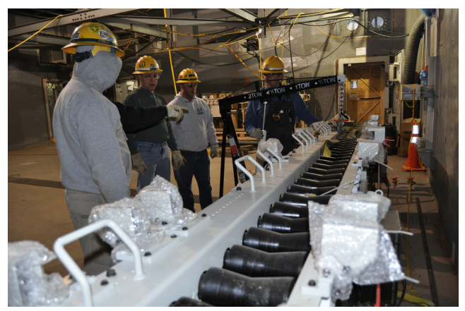
Conveyors are used to transfer the chemical weapons to various stations in the munitions demilitarization building (MDB)